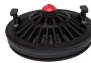
Top Cap option with pressure release Valve & Removal Handles