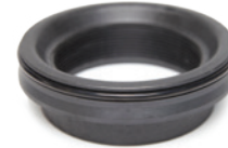
4.5" Threaded top/bottom Commercial Cap threaded connection.