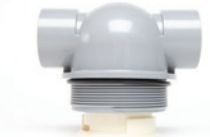
4.5" Bottom Drain Plumbing for Commercial Filters.